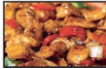
45. Sambal Chicken or Beef $19.90

Lightly coated with egg white, golden fried till crispy, tossed with special sweet chilli sauce