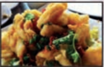
49. Salt & Pepper Calamari or King Prawns $22.90

Beef with vegetables in popular black bean sauce