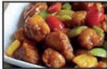
41. Sweet & Sour Pork $18.90