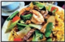
50. Combination Chow Mein $22.90

Our chef's signature dish of fresh calamari or prawns lightly fried in garlic salt and pepper