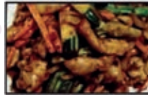
51. Satay Chicken or Beef King Prawns $19.90 $22.90

King prawn, beef, BBQ pork, chicken stir fry, vegetables served with crunchy egg noodles