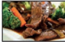
48. Beef with Black Bean Sauce $19.90

Chicken and vegetables in honey soy sauce