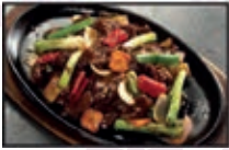
43. Mongolian Beef $20.90

Fresh king prawns or tender sliced chicken or beef infused with garlic, cooked with seasonal vegetables