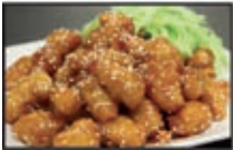
40. Honey Chicken $18.90