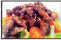
44. Crispy Rainbow Beef $21.90

A favourite in the court of the Qing Emperors - thinly sliced tender beef quickly stir fried in our famous mongolian sauce (mild)