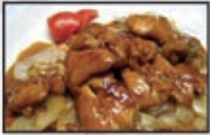
47. Honey & Soy Chicken $19.90

The most popular dish in Thailand, stir fried with roasted sweet chilli paste roasted cashew & mixed veges