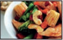
46. Chicken with Thai Cashew & Sweet Chilli Sauce or Prawns $19.90 $22.90

Malay style chicken or beef stir fried with our home made spice sambal sauce