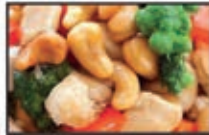
42. Chicken Vegetable with Cashews $19.90 King Prawns $22.90

Fresh king prawns or tender sliced chicken or beef infused with garlic, cooked with seasonal vegetables